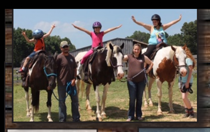
Not all of our fourlegged friends at the